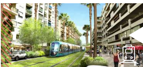
Transforming an urban transport scheme and making it more attractive

Project management for Métropole Nice Côte d'Azur