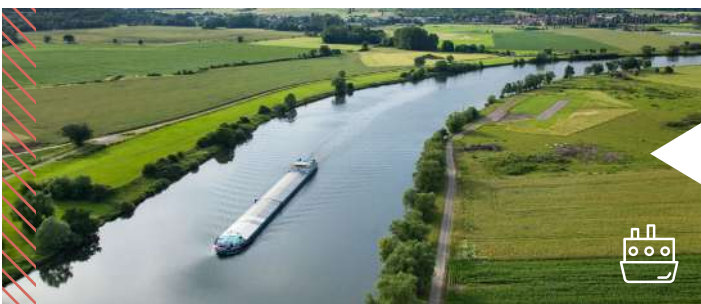
Building 107 km of river infrastructure between the Oise and the Dunkirk-Scheldt canal: the Seine-Nord Europe Canal

Operation Management Société du Canal Seine-Nord-Europe